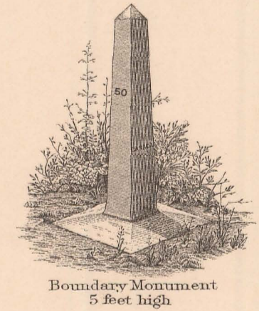
Boundary Monument 5 feet high

Boundary Monuments On original sites ■ On new sites □